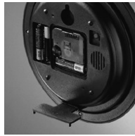
Includes convenient stand for tabletop display

Hear the Amazing Grace Melody at the top of each hour.